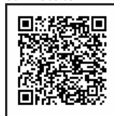
Survey – QR Code